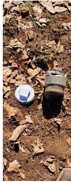
1403 ALMA NORTH STREET