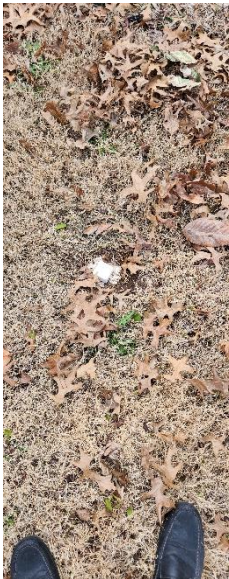
1321 SPRINGDALE DRIVE