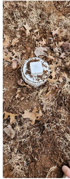
1322 BRIARWOOD DRIVE