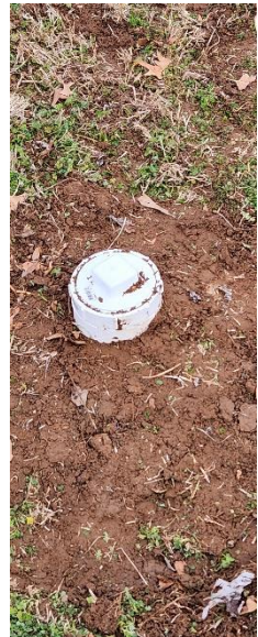
1326 ALMA NORTH STREET