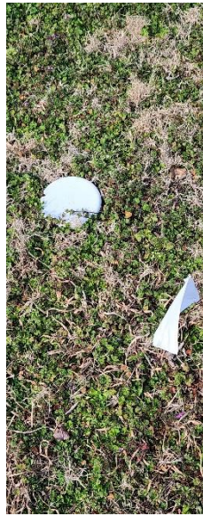
1311 SPRING HILLS DRIVE